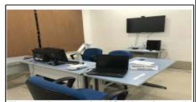
Figure 6: Remote point with VC equipment & Document visualizer