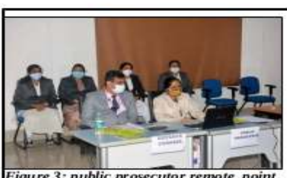
Figure 3: public prosecutor remote point