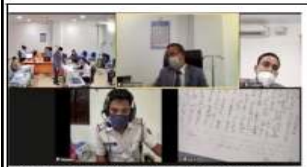
Figure 5: Marking of document using document Visualizer